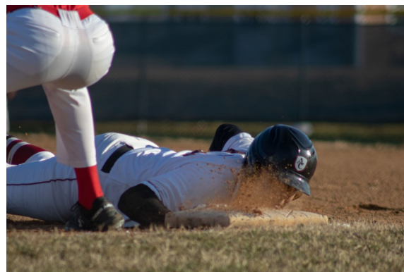
Photos of Fresh Soph Baseball (When weather permitted)