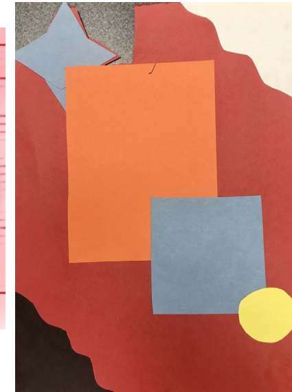
By Sal Schianodicola '21