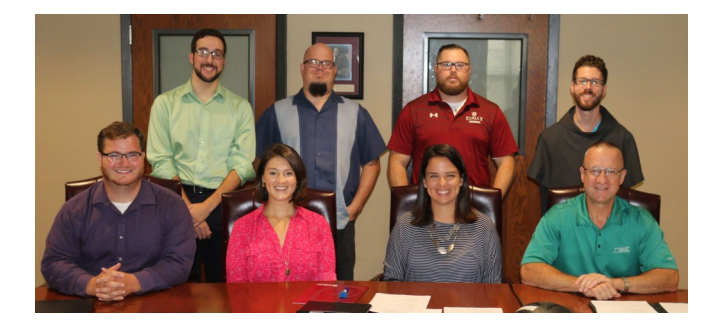
New Faculty Have you learned their names and welcomed them to Curley yet? Who is missing?

Be excellent! First, find your passion! If you have a dream, follow it. Sometimes the key to success is passion. Second, strive to be your best. This feeds off number one. Without trying your best, you will never find that passion and it will be much harder to succeed. Third, do not look behind! For me, this is the most important, it goes along with not having regrets. Once you pick a path, run and do not look back. You will feel more accomplished this way. Finally, plant your seeds and never give up. Establish connections and communicate with people interested in the same thing. Keep going, even when the going gets tough. Take advantage of the support you have at school and at home. Let's make it a great year!