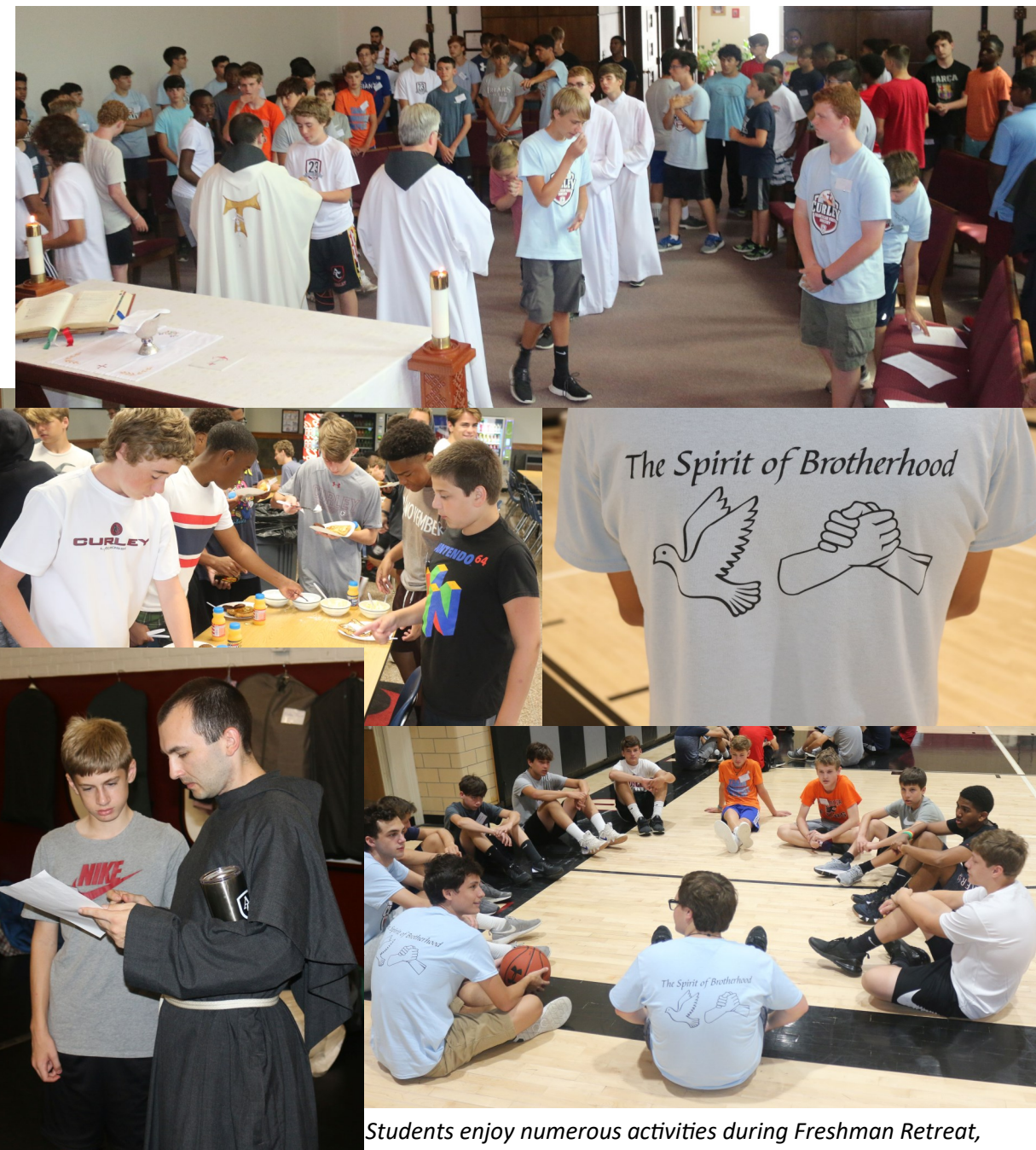
Students enjoy numerous activities during Freshman Retreat, hosted at Curley on August 15-16 and August 19-20.